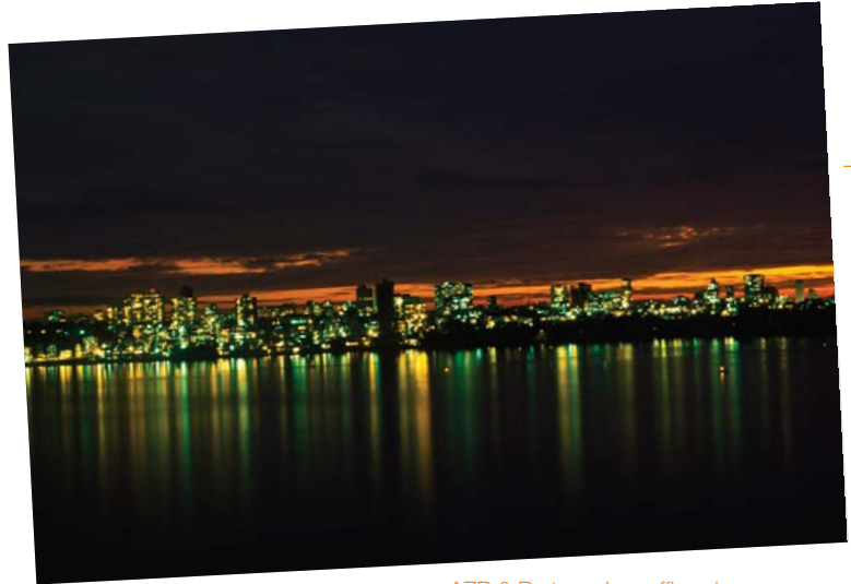
AZB & Partners has offices in Bangalore, Chennai, Delhi, Hyderabad, Pune and Mumbai (above)

Anticipating further liberalisation, we have also established a Singapore-based India capital markets team of international experts and a high-profile lateral hire from India. So we can now offer our global client base Indian law capability of the highest calibre, while giving AZB and its clients access to our international reach and technical expertise.