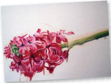
Hyacinthos, by Martin Gustavsson – from the Trans-Atlantic Pride art show

Pride goes transatlantic: celebrating art in New York and London. To mark the annual Gay Pride festivals in New York and London, our LGBT (lesbian, gay, bisexual and transgender) employee networks in both cities staged a Trans-Atlantic Pride art show in June 2008, showcasing work by various LGBT artists. This followed a similar exhibition in New York in 2007. The success of the 2008 show prompted a second transatlantic event in summer 2009.